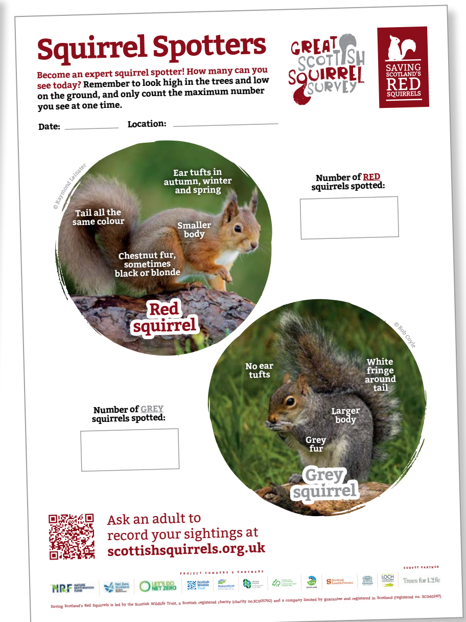
Great Scottish Squirrel Survey worksheet