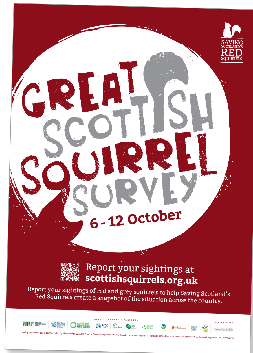
Great Scottish Squirrel Survey A3 and A4 poster