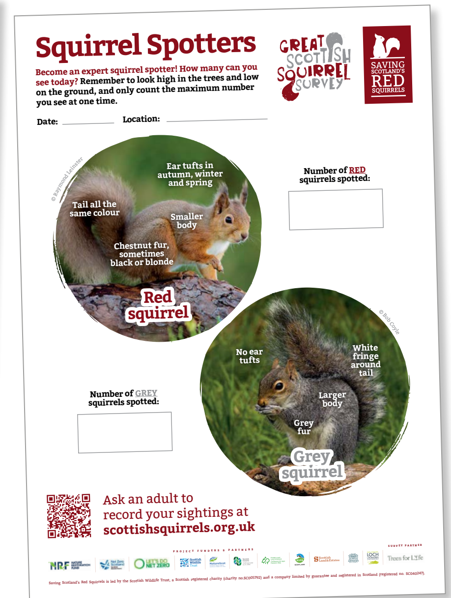
Great Scottish Squirrel Survey worksheet