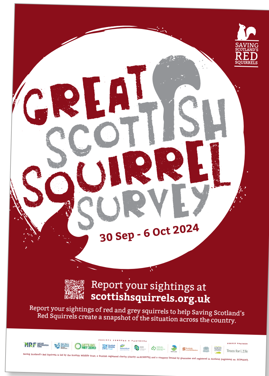
Great Scottish Squirrel Survey A3 and A4 poster