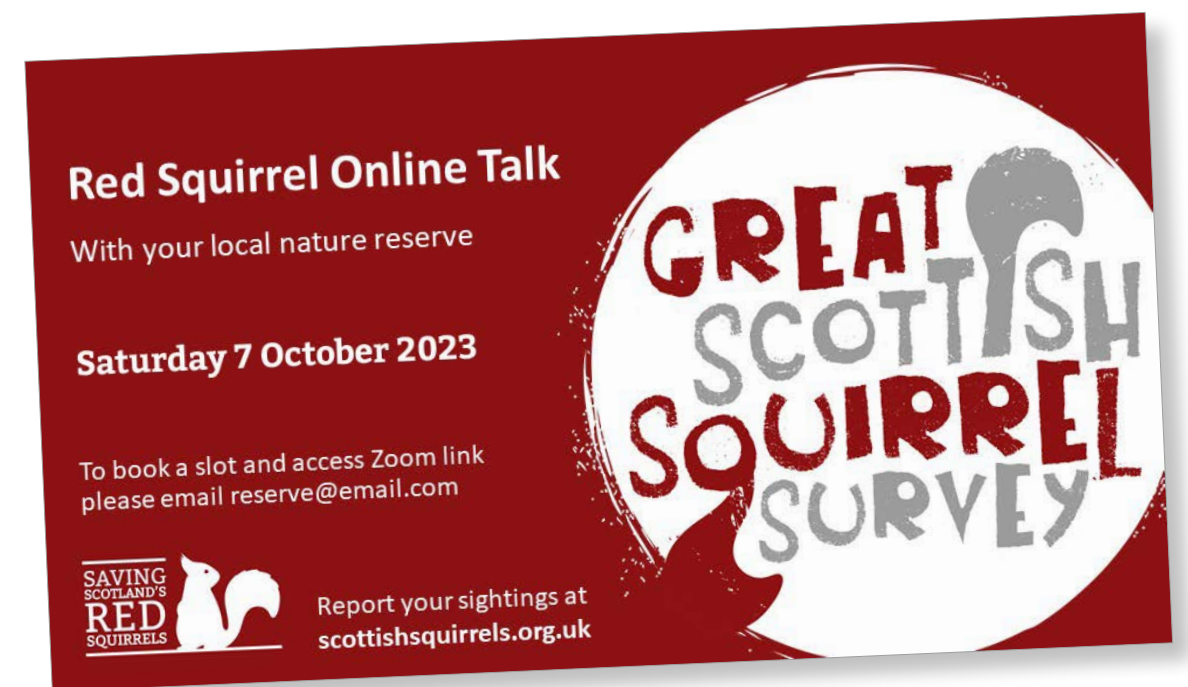
Great Scottish Squirrel Survey event template for social media

GREAT SCOTTISH SQUIRREL SURVEY Red Squirrel Guided Walk Take part in the Great Scottish Squirrel Survey! Join our community woodland group for a walk in the woods as we look out for tufted ears and bushy tails. Explore the family-friendly trail and become an expert squirrel-spotter along the way. Saturday 7 October 12pm – 2pm Meet at the woodland car park Free event, booking essential. Contact us at woodlandgroup@email.com scottishsquirrels.org.uk Saving Scotland's Red Squirrels is led by the Scottish Wildlife Trust, a Scottish registered charity (charity number SC005792). It is also a company limited by guarantee and registered in Scotland (registered number SC040247). GREAT SCOTTISH SQUIRREL SURVEY Red squirrel livestream Get involved in the Great Scottish Squirrel Survey! Grab some breakfast and join the local red squirrel volunteers online as we look out for tufted ears and bushy tails. We will be streaming live from our special red squirrel hide and chatting about the vital conservation work that is happening in the local area. Tuesday 3 October 7am – 8am Streaming live on Facebook.com/squirrelgroup For more information contact us at squirrelgroup@email.com scottishsquirrels.org.uk Saving Scotland's Red Squirrels is led by the Scottish Wildlife Trust, a Scottish registered charity (charity number SC005792). It is also a company limited by guarantee and registered in Scotland (registered number SC040247).