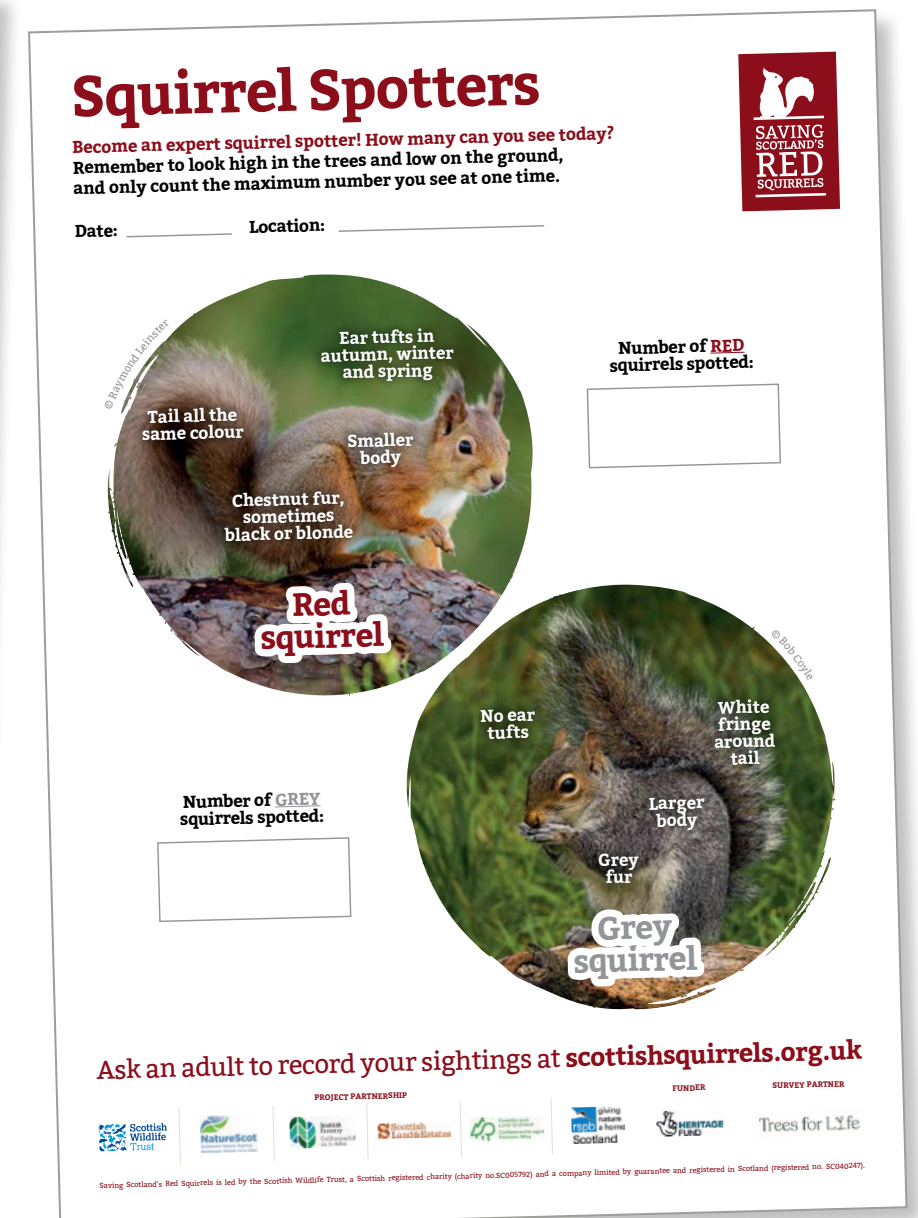
Great Scottish Squirrel Survey worksheet