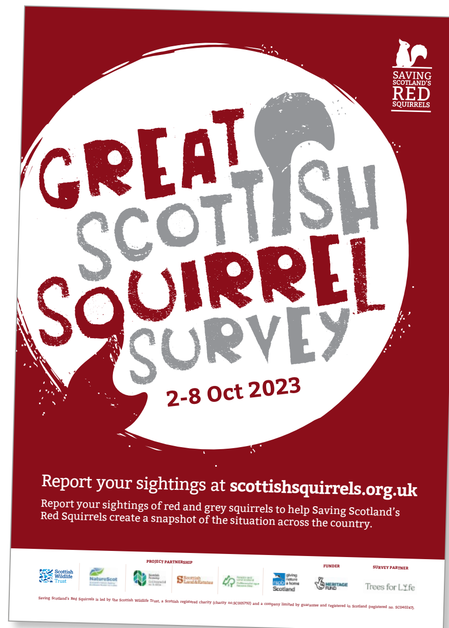
Great Scottish Squirrel Survey A3 and A4 poster