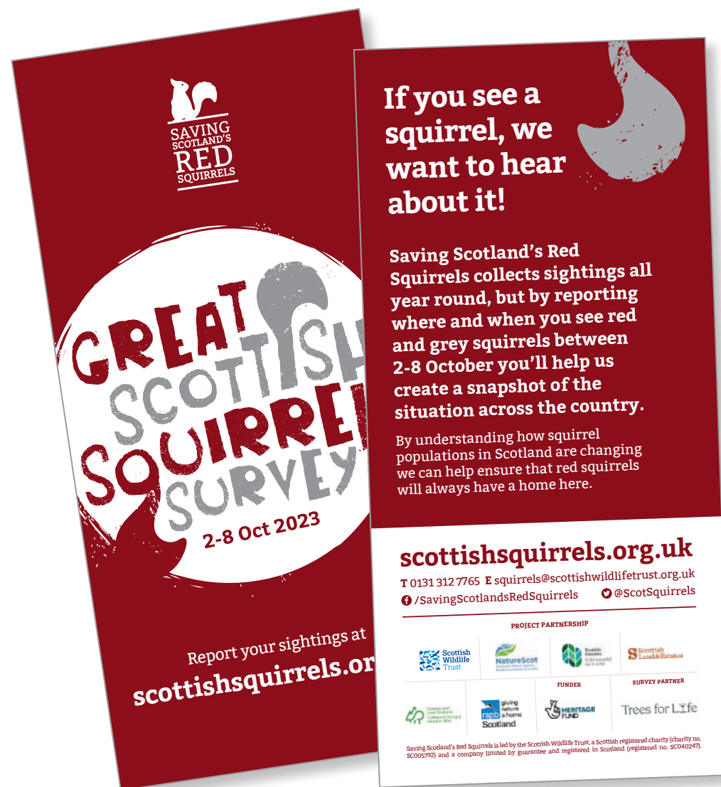
Great Scottish Squirrel Survey flyer

The following materials are available for downloading and self-printing, for display at reserves, workplaces, visitor centres and other community meeting places. Some limited financial support may be available to cover printing costs - please get in touch if your organisation or group is interested.