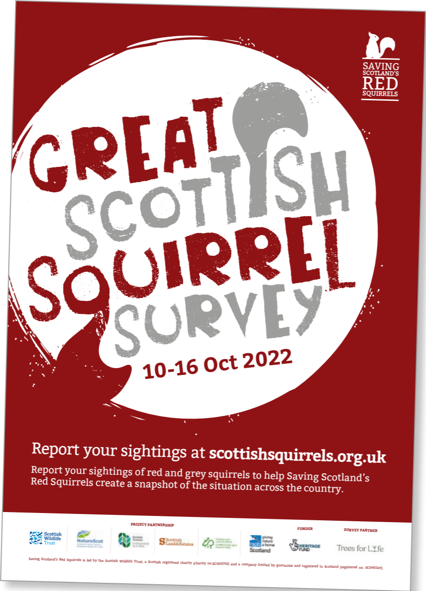
Great Scottish Squirrel Survey A3 and A4 poster

The following materials are available for downloading and self-printing, for display in visitor centres and other community meeting places. Some limited financial support may be available to cover printing costs - please get in touch if your group is interested.