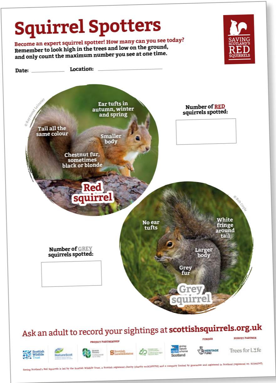
Great Scottish Squirrel Survey worksheet