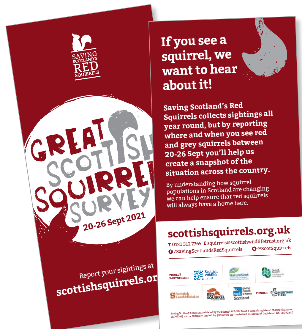
Great Scottish Squirrel Survey flyer

The following printed materials are available to order, for display in visitor centres and other community meeting places.