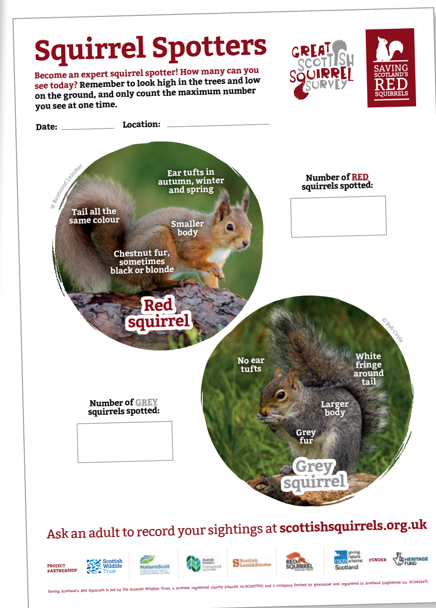
Great Scottish Squirrel Survey worksheet