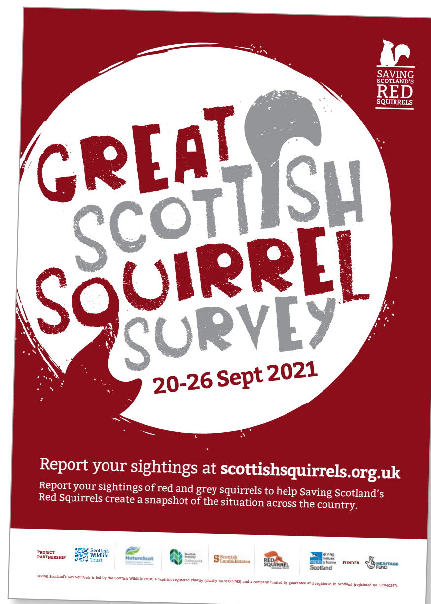
Great Scottish Squirrel Survey A3 and A4 poster